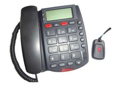
Scan to learn more